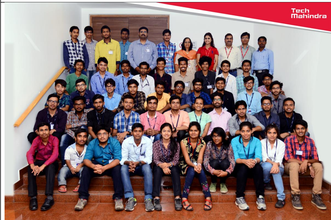
Group Picture of Students, Faculty and Tech Mahindra Experts.